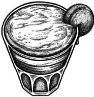
MOZE BEL LABAN

Our take on limeade, the Limonata is made with fresh limes, water and mint. It is guaranteed to be the best citrus drink you've ever had. (Add condensed milk for $1.00)