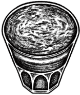
BEET IT UP

The Moze bel Laban is the best banana-milk drink you'll ever taste. It's simple, but delicious, blended fresh and sweetened just right.